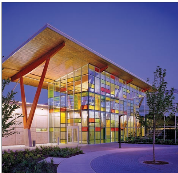
Left: new atrium for Telus Corp. Above: Kwantlen University College trades and technology centre